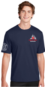
Mens SM-4X Description/Measurements

Start & Finish Davis School 5224 E. Morada Lane