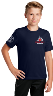
Youth Size XS-XL Description/Measurements