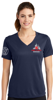
Ladies XS-XL Description/Measurements